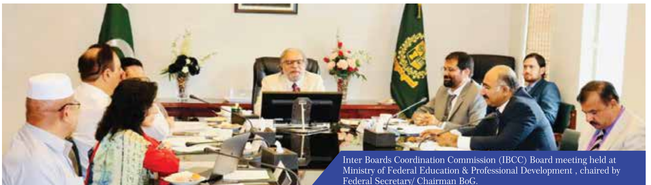
Inter Boards Coordination Commission (IBCC) Board meeting held at Ministry of Federal Education & Professional Development, chaired by Federal Secretary/ Chairman BoG.