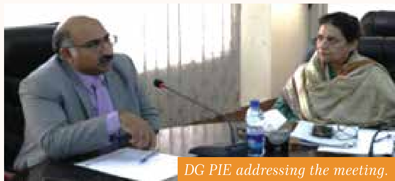
DG PIE addressing the meeting.

The meeting served as a platform to foster collaboration between stakeholders, with a specific focus on the availability and sharing of data related to special education. Discussions were initiated to explore potential avenues for effectively utilizing existing data in line with PIE's evolving functions as a newly established organization.