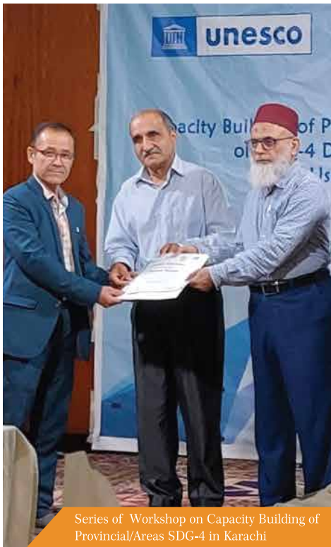
Series of Workshop on Capacity Building of Provincial/Areas SDG-4 in Karachi