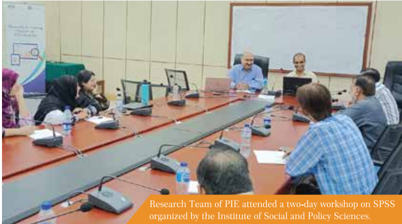
Research Team of PIE attended a two-day workshop on SPSS organized by the Institute of Social and Policy Sciences.