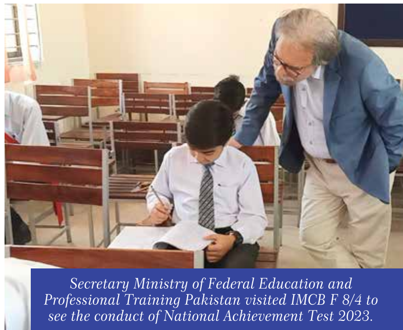
Secretary Ministry of Federal Education and Professional Training Pakistan visited IMCB F 8/4 to see the conduct of National Achievement Test 2023.

control. This collaboration kicked off with an item development workshop in December 2022, followed by a piloting phase in February 2023, and then item analysis and review workshops. The final tests were conducted from March 13-17, 2023. The item review workshop led to completion of test material printing by the end of April 2023. Test administration training sessions were conducted from May 3-12, 2023. Subsequently, the nationwide assessment exercise for NAT-2023 was carried out on May 18-19, 2023.