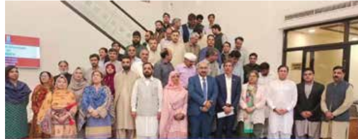
تعلیمی ایشیا میں پاکستان، بھارت، بنگلہ دیش، سری لنکا اور نیپال کے مابین سوڈان میں قرآن پاک کی بے غرضی کے واقعہ پر تاجر برادری سراپا احتجاج لاہور 19