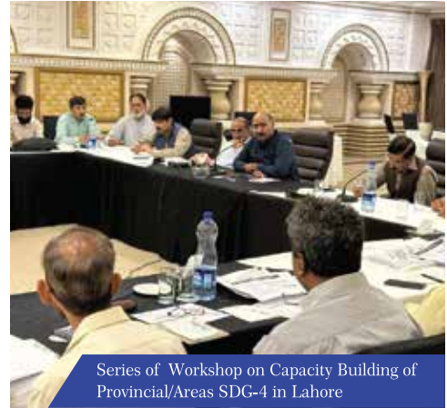
Series of Workshop on Capacity Building of Provincial/Areas SDG-4 in Lahore